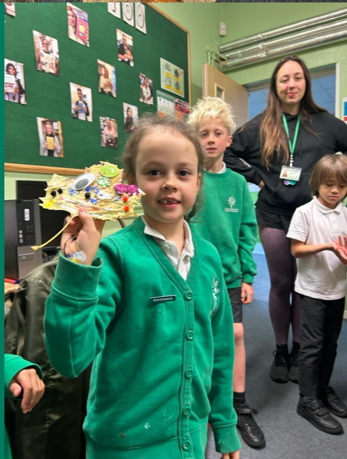
Some lovely leaf art from our ECO Council